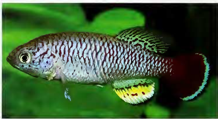
Fig. 1. Nothobranchius seegersi , adult male, not preserved, Tanzania, seasonal pool on right side of the main road T8 from Ipole to Rungwa, near Mabangwe village.

Holotype. ZFMK 41848, 1 male, 44.5 mm SL, seasonal pool on the right side of the main road T8 from Ipole to Rungwa, near Mabangwe village, close by the bridge over the Limba Limba River, altitude 1114 m, Malagarasi River drainage, Tanzania, 5°59'1" S, 32°48'5" E, 2 June 2008, Kiril Kardashev and Iva Ivanova.